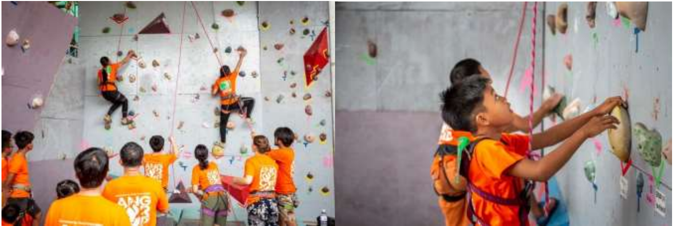
Speed M-1 : Male Youth BCD born in 2003 or after : 21 Participants

were set side by side. Of course there are no auto-belayer and no motorized stopwatches, so each needed two belayers and referees timed the races manually. Since the race was a top rope, 56 people participated, including beginners who were just getting started and were far from “speed”