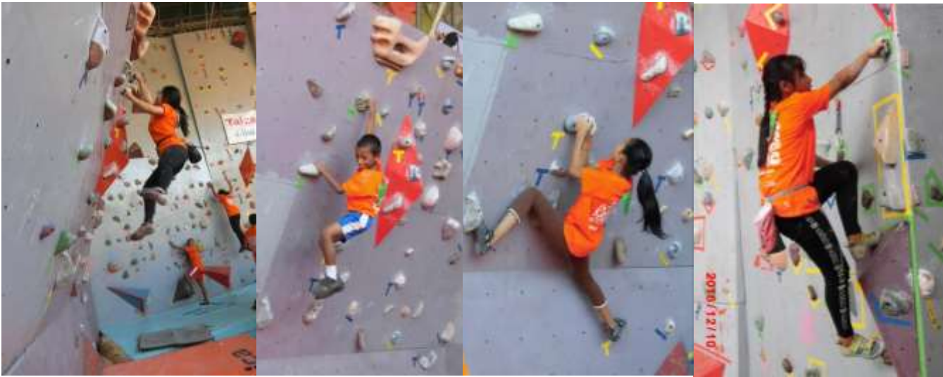
Outside isolation zone

to how many climbed. Since the day was a Cambodian holiday, a total of 53 people including many beginners participated.