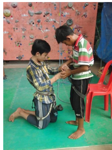
Pictured at the workshop in November