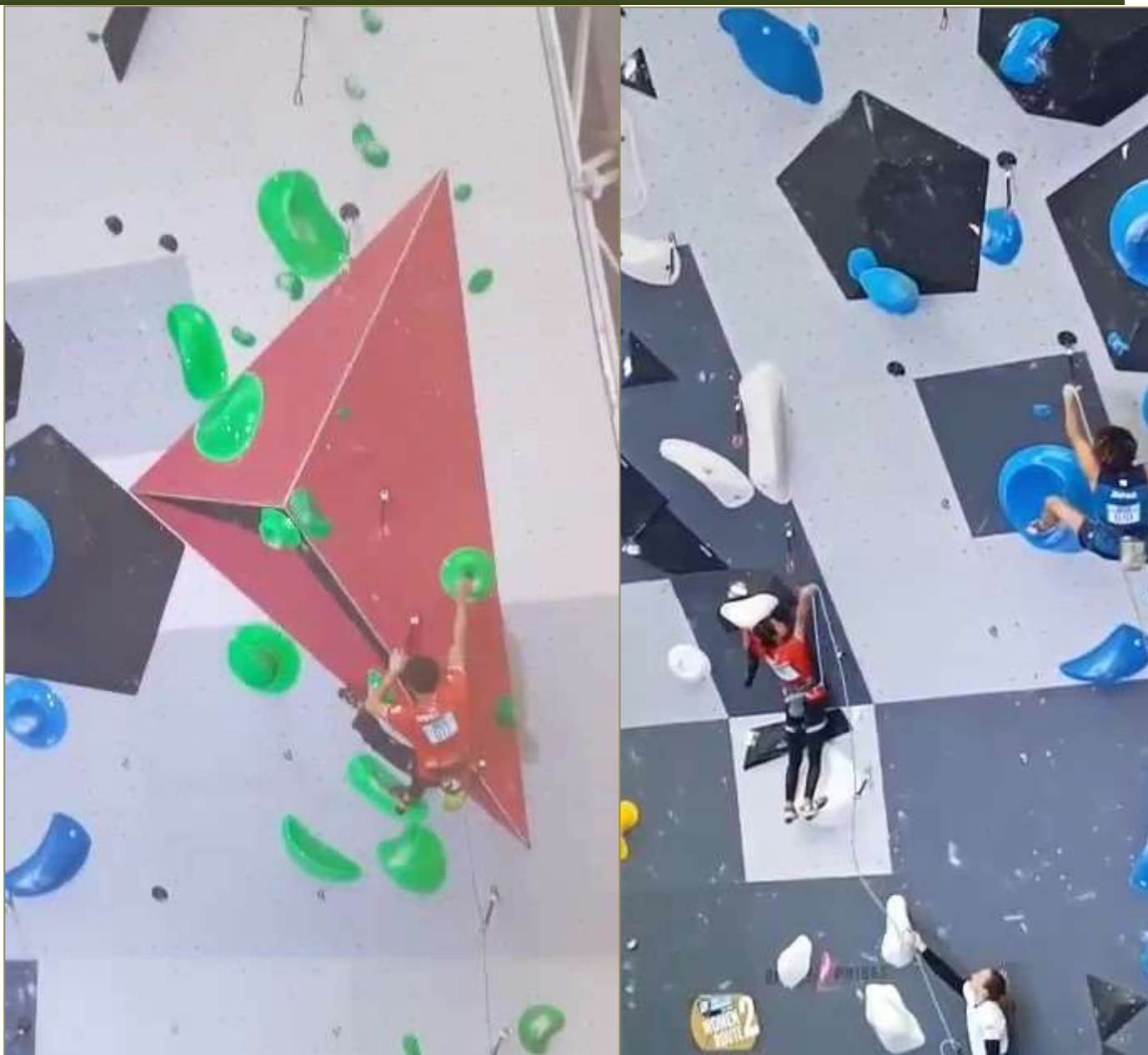
June 30th World Cup Lead Qualifying in Villars, Switzerland