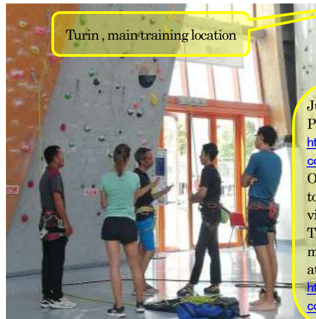
Turin , main training location