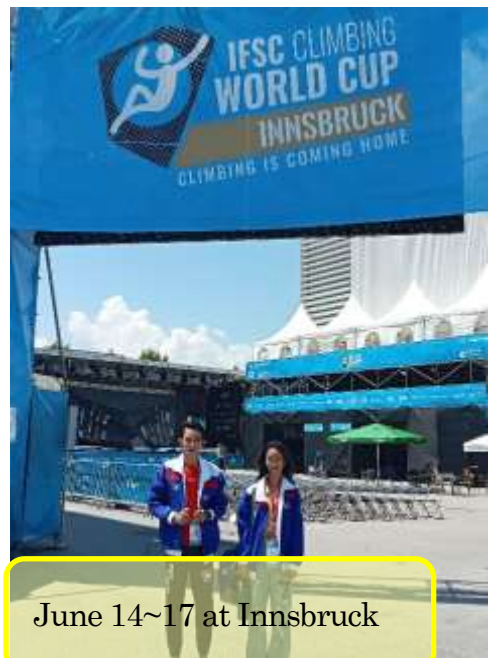
June 14~17 at Innsbruck