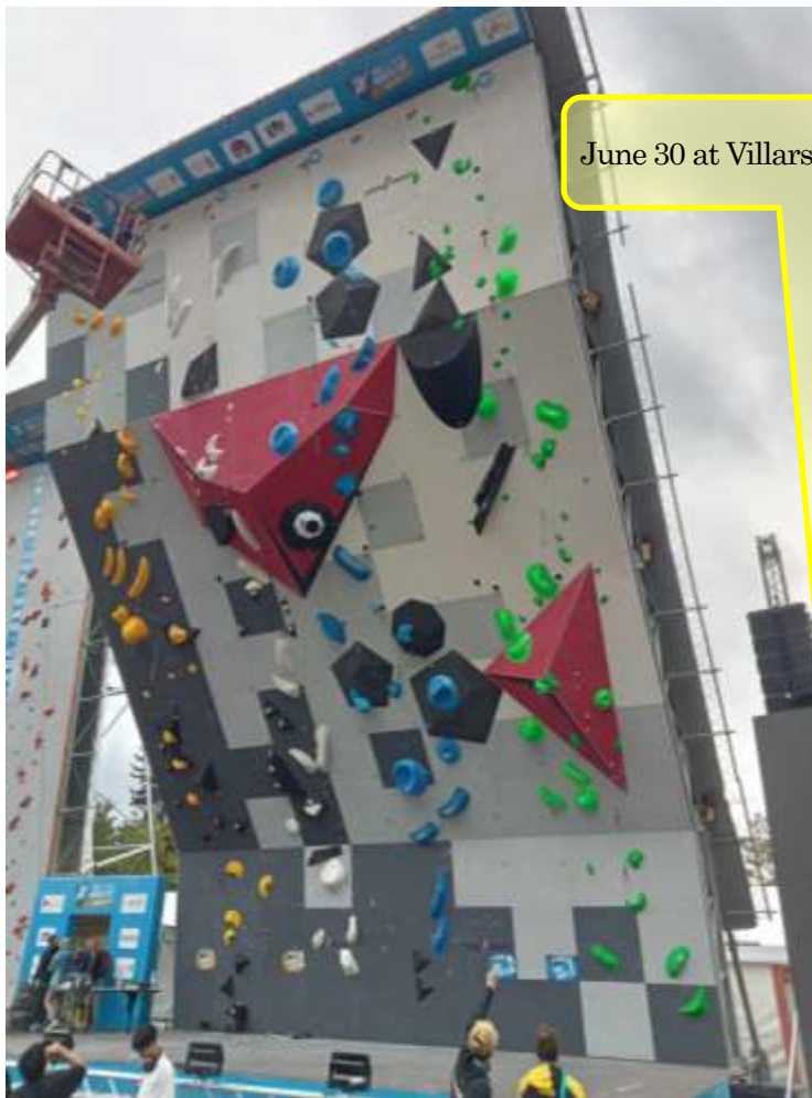
June 30 at Villars Lead