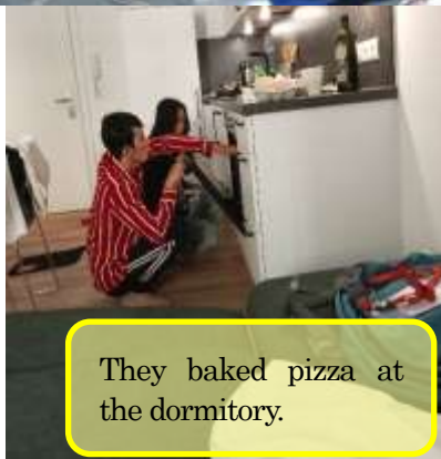
They baked pizza at the dormitory.

https://www.ifsc-climbing.org/index.php/world-competition/calendar/?task=resultathletes&event=1296&result=7